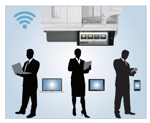
Built-in wireless network interface for convenient scanning and printing from mobile devices.