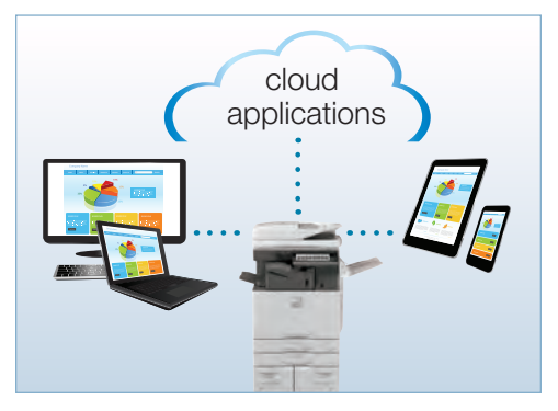
Distribute, access and print documents more easily.