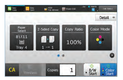
Easy Copy Screen offers the most commonly used settings.