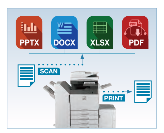
Scan and convert documents to popular file formats seamlessly with Sharp's built-in OCR function.