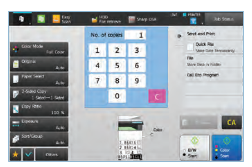
Standard Copy Screen offers more advanced features.