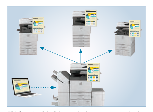
With Serverless Print Release technology you can securely print a job and release it from any of five color Advanced Series models.