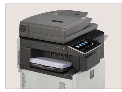
Compact inner finisher option provides high productivity.