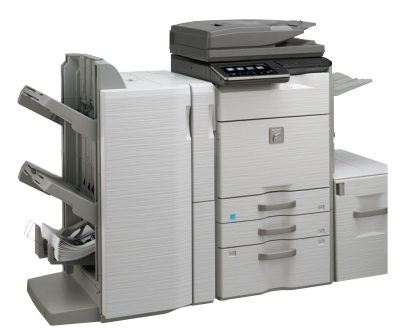
MX-M565N shown with options.