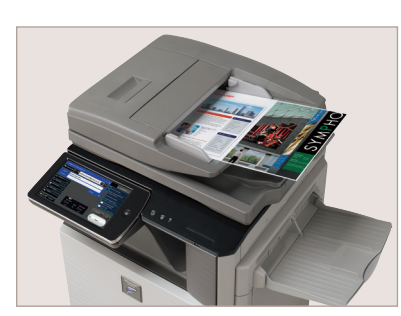
Standard 150-sheet DSPF scans up to 170 images-per-minute.