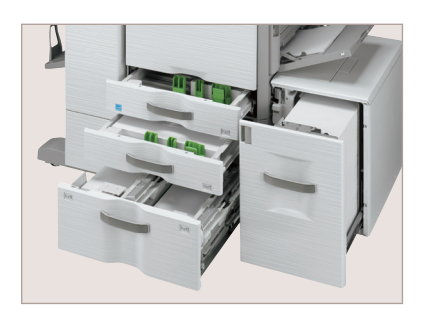
Up to 6,600-sheet paper capacity with available options.