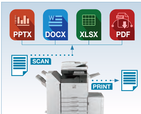
Scan and convert documents to popular file formats seamlessly with Sharp's built-in OCR function.