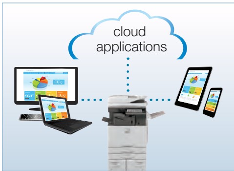
Distribute, access and print documents more easily.