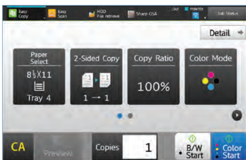
Easy Copy Screen offers the most commonly used settings.