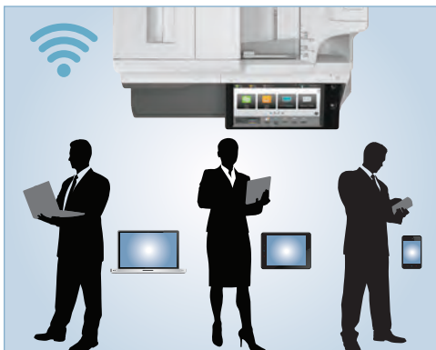
Built-in wireless network interface for convenient scanning and printing from mobile devices.

From paper handling to networking, the MX-3070N, MX-3570N, and MX-4070N color Advanced Series will exceed your expectations.