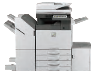
MX-4070N shown with 3K saddle stitch finisher and large capacity cassette.