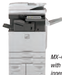
MX-4070N shown with compact inner finisher.

When it's time to get the job done, the Advanced Series color document systems are outstanding performers. Quickly scan documents at speeds up to 200 images per minute . Built-in optical character recognition (OCR) can convert your scanned documents into text-searchable PDFs or Microsoft Office file formats, simplifying your workflow. Use the manual stapling feature on select finishers to restaple your originals. Multiple finishing options give you the output you require, be it stacked, stapled, or saddle-stitched. There's even an available built-in stapleless staple feature, which can bind up to five sheets of paper by adding a crimp to the corner of the set, saving regular staples for larger sets.