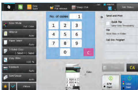
Standard Copy Screen offers more advanced features.