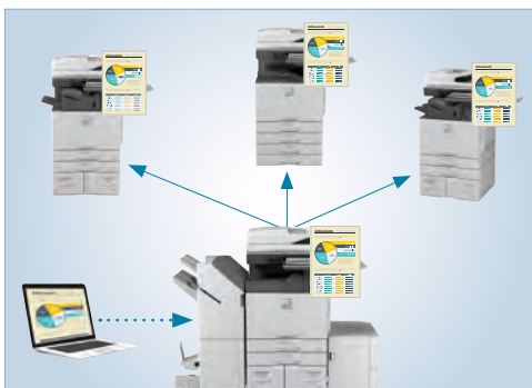
With Serverless Print Release technology you can securely print a job and release it from any of five color Advanced Series models.