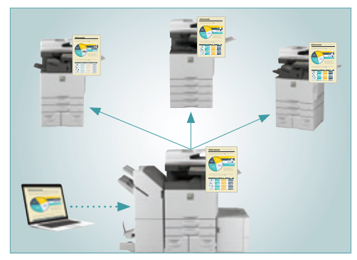
With Serverless Print Release technology you can securely print a job and release it from any of six color Essentials Series models.