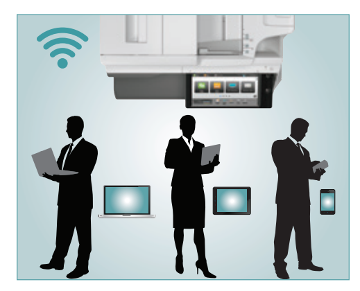
Available wireless network interface for convenient scanning and printing from mobile devices.