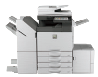
MX-4050V shown with 3K saddle stitch finisher and large capacity cassette.