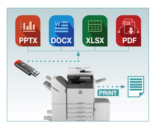
Direct print to popular file formats seamlessly with Sharp's available direct print expansion kit.<sup>1</sup>