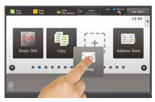
Work your way. Drag and drop icons to create a customised home screen.

Every workplace includes people with different levels of technological ability. And at Sharp, we understand that advanced technology needs to be accessible to be truly useful. Pairing smarter functionality with user-friendly features – these MFPs are designed to save everyone time.