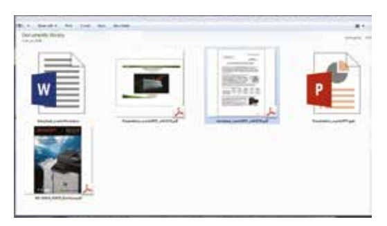
Convert scanned documents into editable files.

There's also the option to add the ability to generate URLs to share large volumes of scanned data via email.*1