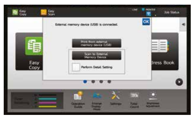
Plug in and print from your USB memory stick.

If you prefer to, you can also print Microsoft® Office files*<sup>3</sup> directly from a USB.