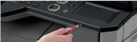
USB 2.0 port is located on the front panel for easy access*

Impressive workflow efficiency with leading edge features that help deliver optimum results.