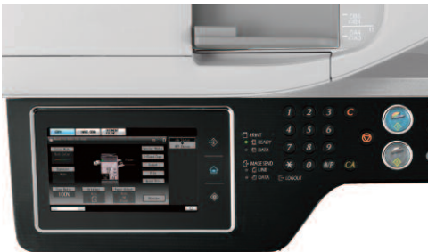
High-resolution touch screen with Stylus pen for easy point-and-touch operation