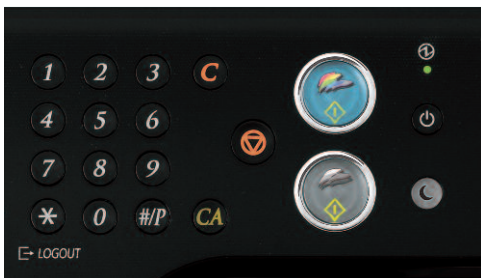
Separate print buttons for B&W and Color allow users to selectively manage use of color

Managing all of the advanced features of your Sharp product is simple and easy. Ask your Authorized Sharp Dealer about the My Sharp website . This dedicated customer training website is customized to your MX-2616N/MX-3116N and allows you to locate resources and find information specific to your configuration, truly helping you maximize your investment.