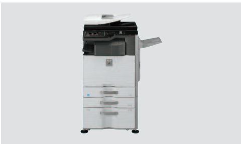
Available paper capacity stores up to a maximum of 3,100 sheets with options