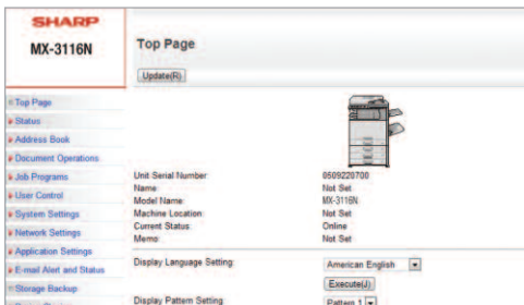
Embedded web page