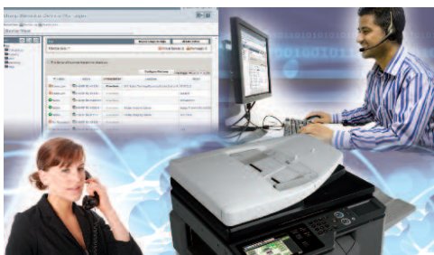
Sharp Remote Device Management