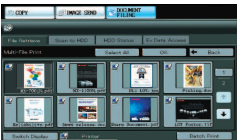
Sharp's easy-to-use Document Filing System with thumbnail preview